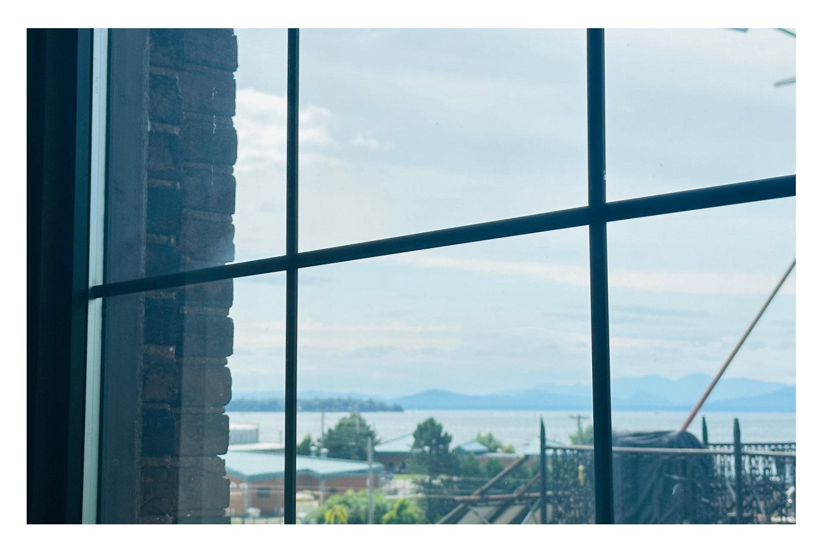
A - $4,500