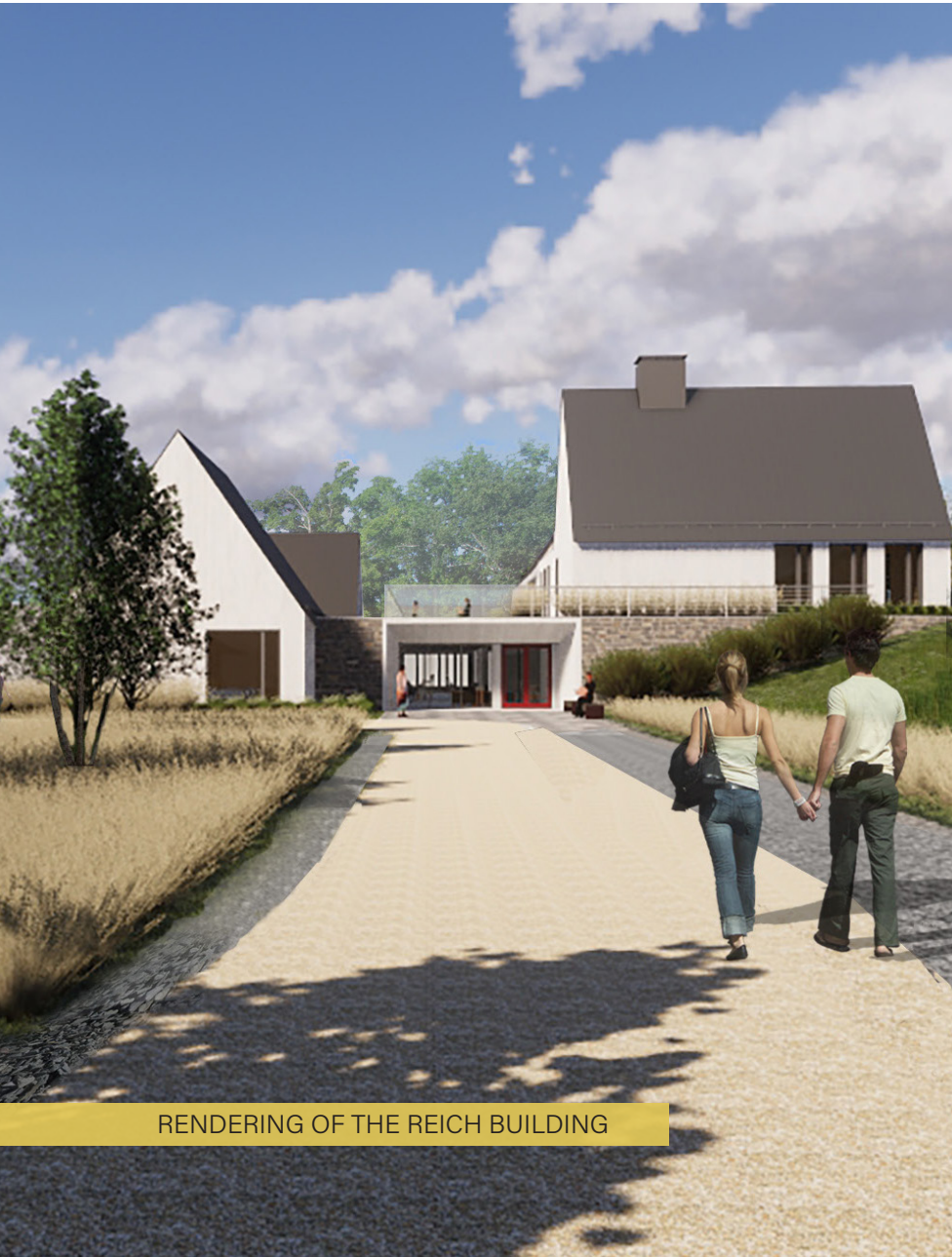
RENDERING OF THE REICH BUILDING

The Marlboro Music Festival, a world-renowned classical music retreat and concert series, is held for seven weeks each summer on the Marlboro College Campus. Since being founded in 1951, the campus has hosted the festival, which drew 7,000+ visitors in 2019. Marlboro Music, a separate institution from Marlboro College, is constructing two new buildings on the campus - the Jerome & Celia Bertin Reich Building and a new 18-room residence hall. The Reich Building will house a music library as well as offices, social spaces and chamber music rehearsal studios for the music school that will be available for use as classrooms throughout the school year. Construction completion is expected in the summer of 2020.