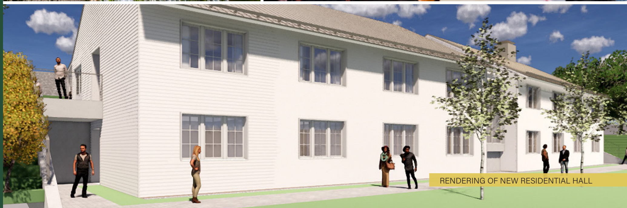
RENDERING OF NEW RESIDENTIAL HALL