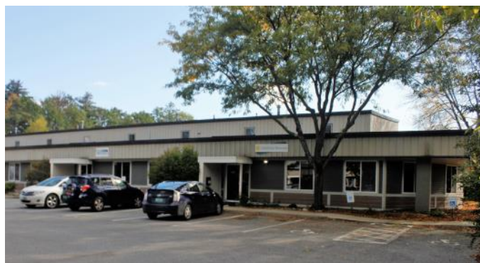
Building B, Units 7-10