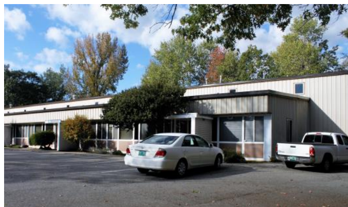
Building A, Units 1-5