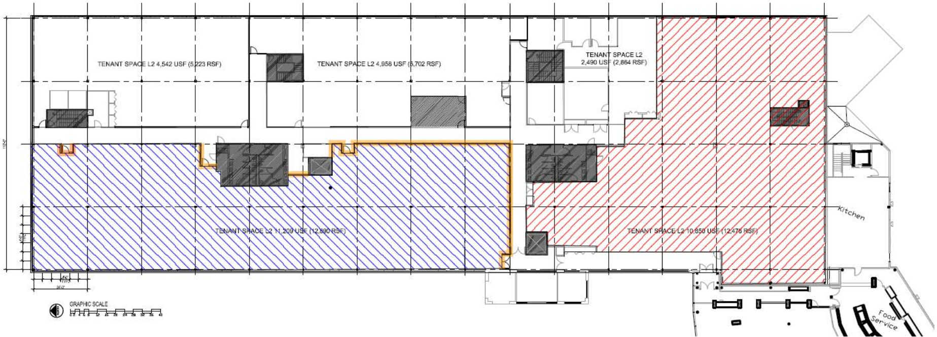
2nd Floor Multi-Tenant Concept Rendering