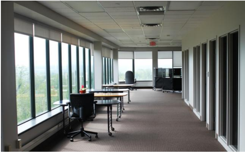
A wall of windows surrounds the floor