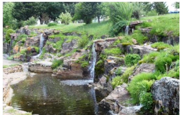
Beautifully landscaped grounds